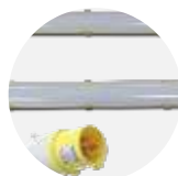
Lighting Kit FRLK-110