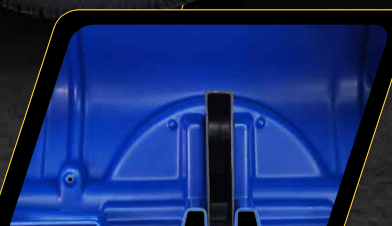
10mm Thick & Baffled Tank