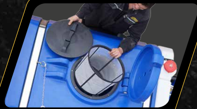
Lockable Hinged Tank Lid with removable Basket Filter