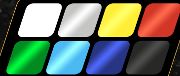
Large choice of Tank & Chassis Colour Combinations