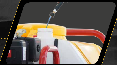
Integral Anti-Freeze & Detergent Tanks