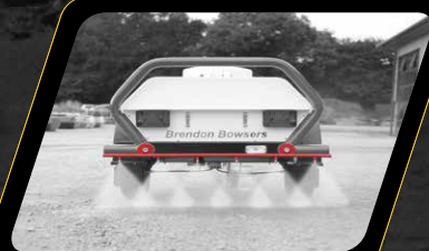
Optional Extra: Rear mounted spray bar for dust suppression