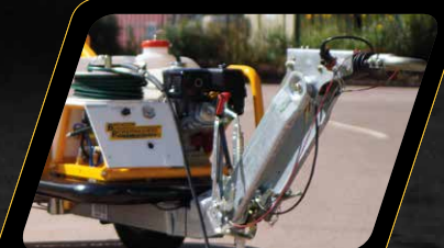
Choice of 50mm Ball or Eye couplings - Alko Adjustable Hitch available