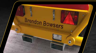
Optional Extra: Rear Forklift Points