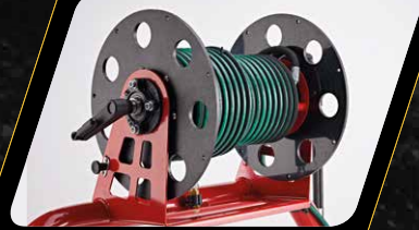
Optional Extra: Manual or 12V DC Electric Hose Reels for 30M - 100M of HP Hose