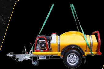
3 Point Lifting Points